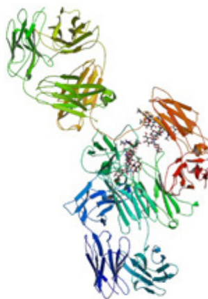
Adalimumab C 6428 H 9912 N 1694 O 1987 S 46

44. Due to a biologic's complexity, biosimilars, the generic equivalent of biologics, are generally more challenging and expensive to produce than small-molecule generic drugs. Products containing living cells are sensitive to their environments; to produce a product that is sufficiently similar to the pioneer biologic, a biosimilar manufacturer must create unique processes to manipulate the cells. Further, slight variations in the chemical structure of each biosimilar make it more challenging to achieve consistent clinical study results.